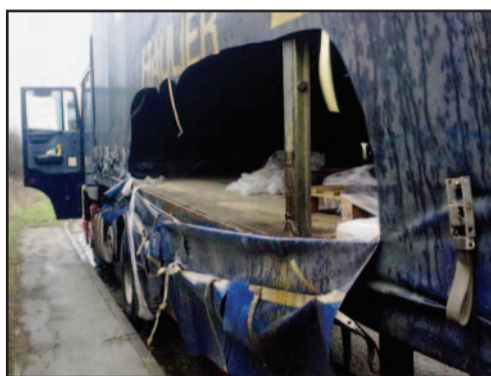
Attacks on vehicles and drivers are a worrying factor