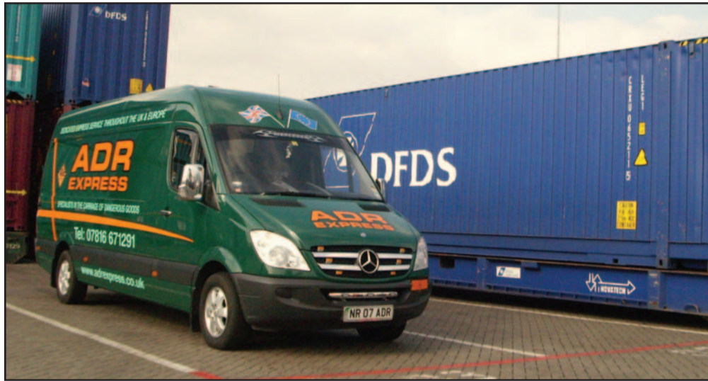
ADR Express offers a dedicated service throughout the UK and Europe

DANGEROUS GOODS SPECIALIST FOR ALL 9 CLASSES